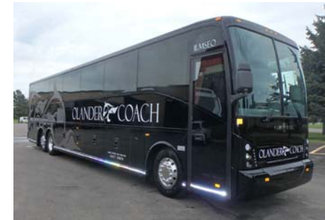
Van Hool model CX45 ABC Coaches is the North American distributor Not yet “Buy America” qualified (bus to Altoona in 2021- new final assembly plant in Florida)