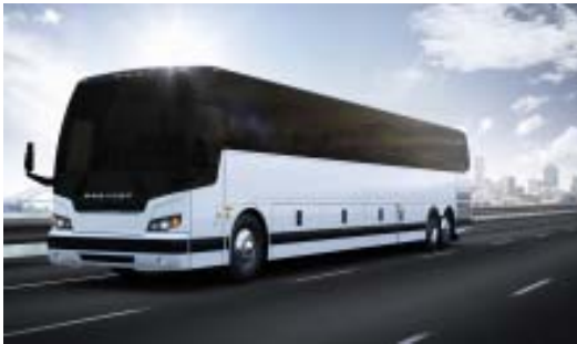
Prevost model X3-45 Subsidiary of Volvo “Buy America” qualified