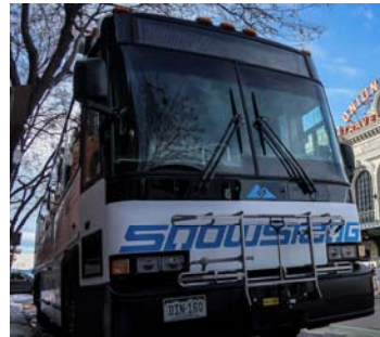
Motor Coach Industries (MCI) model D4500 Subsidiary of New Flyer “Buy America” qualified